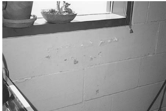
delamination of interior coating